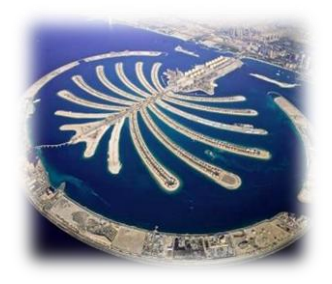
Day 5 :- Day at leisure

After breakfast, you have the entire day at leisure. You can enjoy shopping and explore the city on your own or you can opt for any optional tours on additional price. Overnight in Dubai.